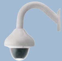
Pendant wall mount