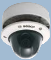
Surface or recessed mount